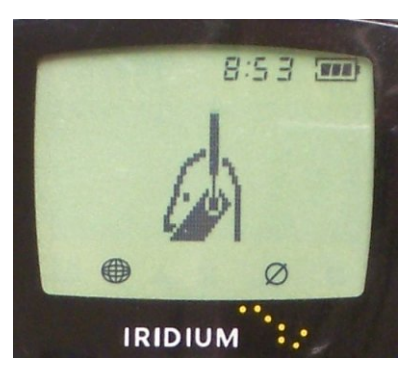
Boot animation - antenna

Boot Animation. The Docking Station is performing a self-check. Troubleshooting: If your system fails during this step, contact your reseller. Your