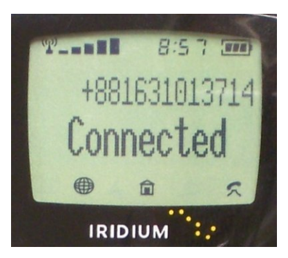
Calling with SmartDial